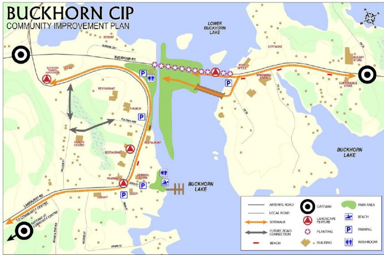
Figure 2 Public Realm and Infrastructure Improvements

Another recommendation in the Trent Lakes Open Space Master Plan is to upgrade the existing trail that runs from the Buckhorn Community Centre to Adam and Eve Rocks, offering an additional connection to the Buckhorn commercial core. The Buckhorn Streetscape & Greenspace Master Plan also contains recommendations that include a series of accessible walkways, pedestrian crosswalks, a recreational trail from the Buckhorn Community Centre to Downtown Buckhorn, and connecting Buckhorn to a larger Regional trail network.